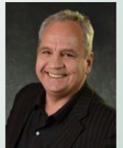
Homebuyer Connect by Sun West Mortgage

6131 Orangethorpe Ave Suite 500 Buena Park CA 90620